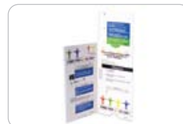
Communication Slide Rule